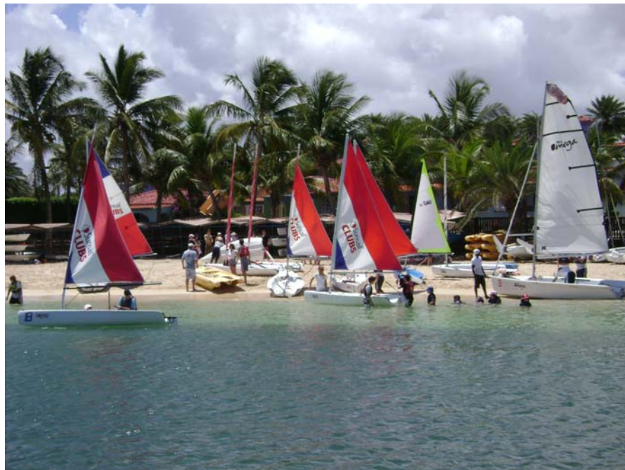
ASA Member's week at Club Colonna

April 16 - Depart for two weeks to Antigua: week one, Classic week and the ASA member's event., week two, the world famous Antigua Race Week!