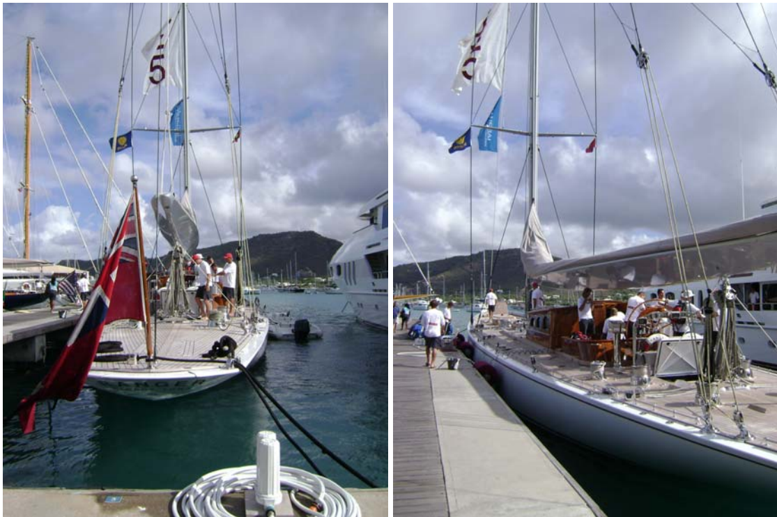
J Boat "RANGER" heading out for the race.