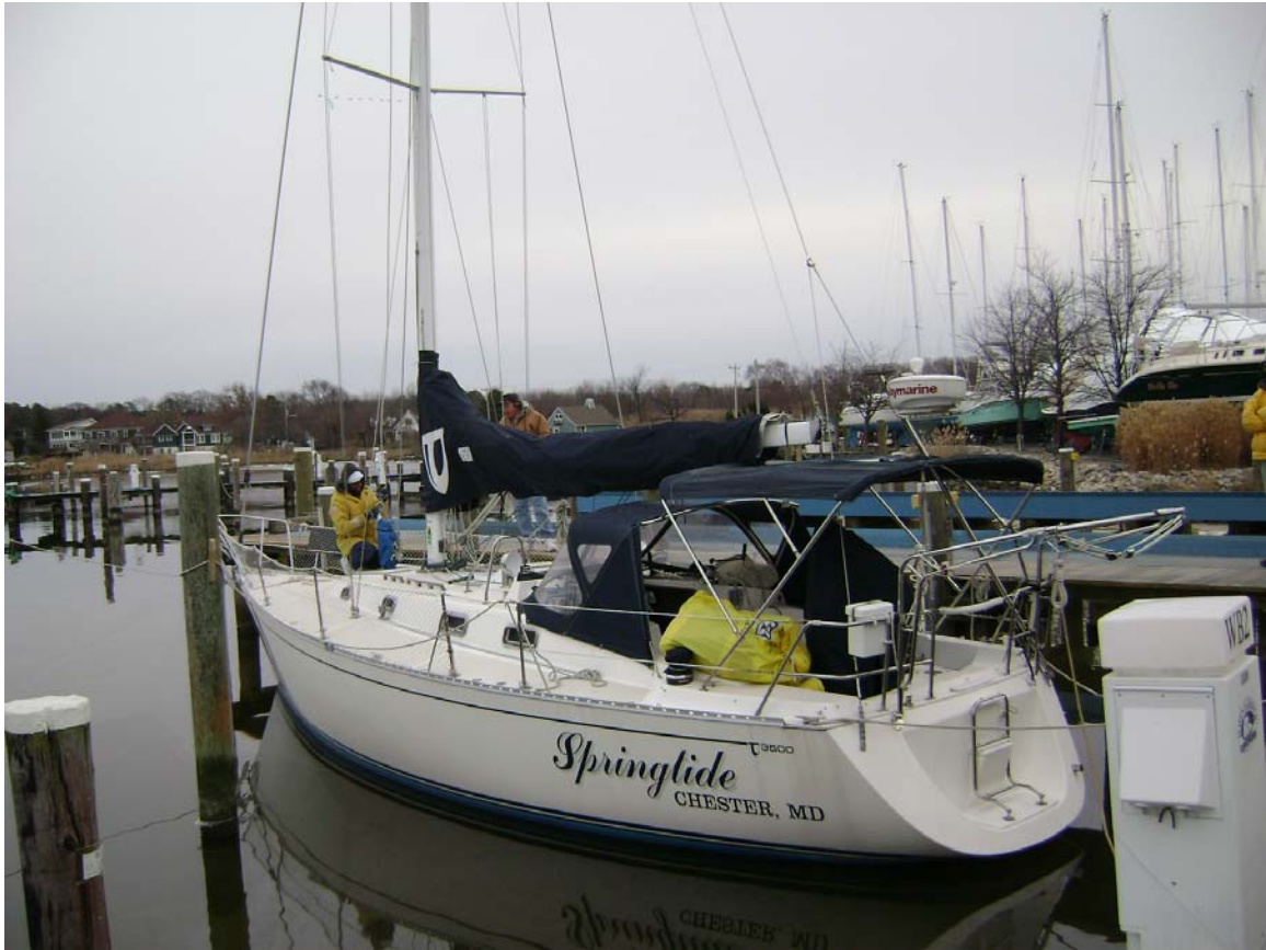
Springtide before the snow!