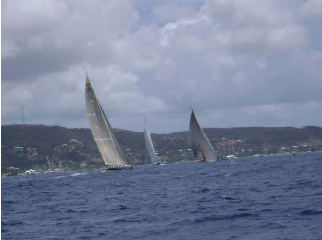
J Boats Cross Tacks