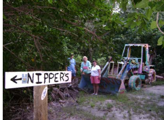
Geo Cache..... on Guana Cay.