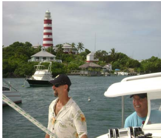
Looking for a mooring in Hope Town.

December began with the St Pete Boat Show and Polyphonic is a cover girl, we made the cover of Southwinds.