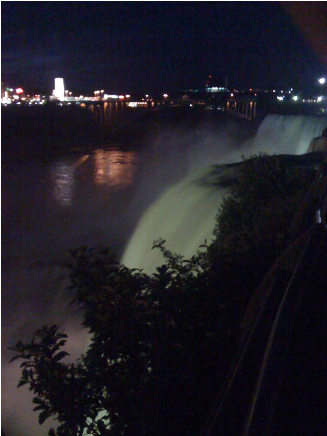
We were only a short drive to Niagara Falls pictured here at night!

The three week journey ended with a left turn to Buffalo and a right turn to visit the falls.