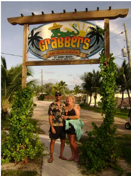
Grabbers on Guana Key!