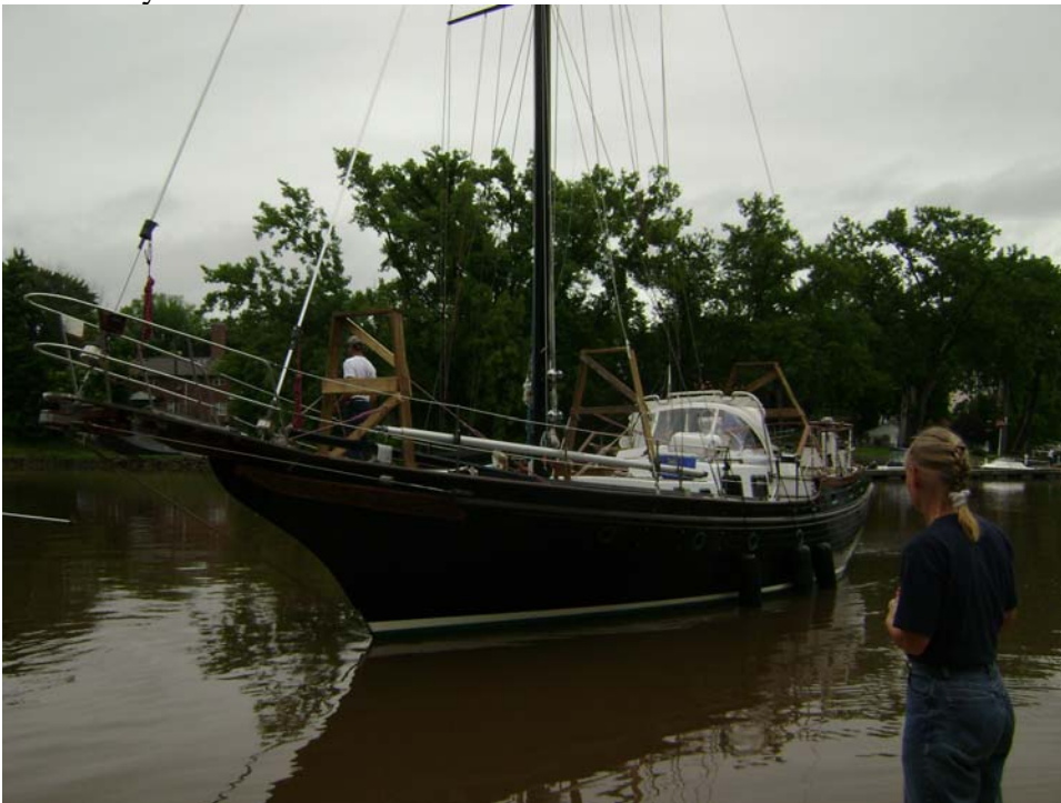
The Black Swan at Hop O Nose, Before the Masts came down.