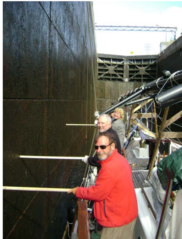
Holding the boat off the lock walls we stick it to ‘em!