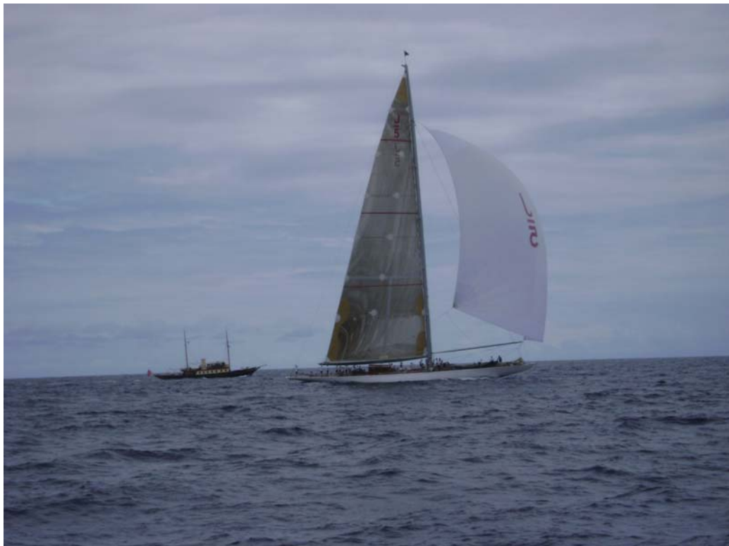
“RANGER” fly’s a kite!